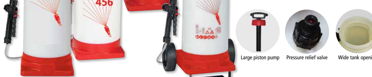
Large piston pump Pressure relief valve Wide tank opening