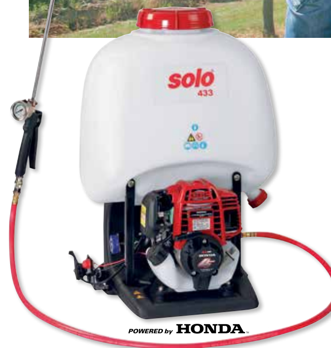
433 Motorized Backpack Sprayer

Can reach extremely high operating pressures and achieve fine mist application even at extreme distances.*