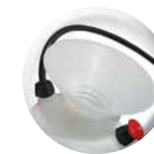
Built-in funnel top for easy fill-up