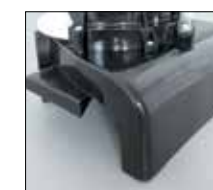
Secure base and ergonomic moulding