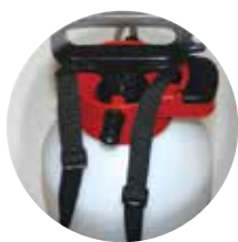
Adjustable webbed nylon carry strap