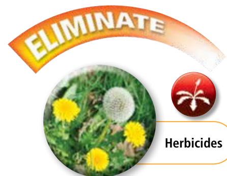
Eliminate Weeds and Grasses