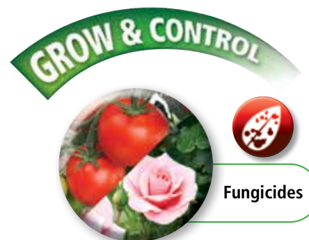
Grow Flowers, Plants, Fruits and Vegetables