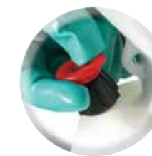
Pressure relief valve vents excess pressure