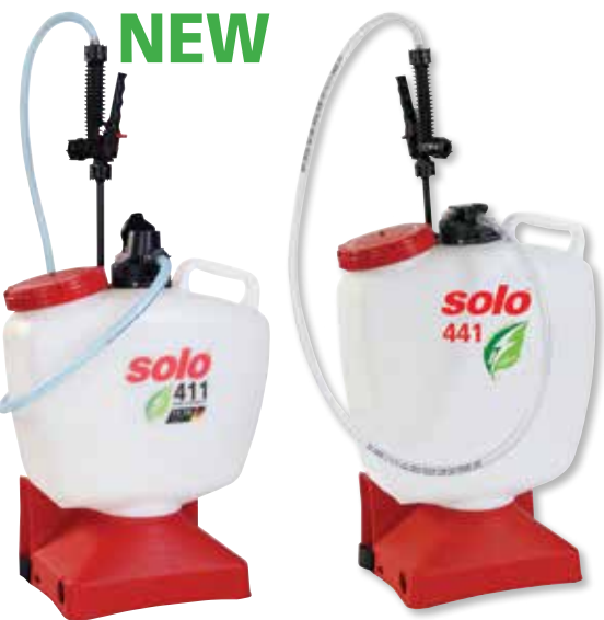
411 and 441 Battery-Powered Backpack Sprayers