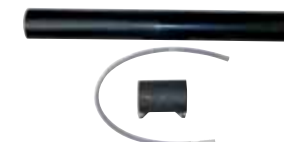
Extension wand Part # 49 00 333