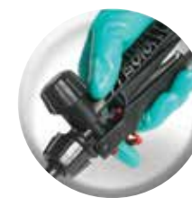
Easy grip shut-off valve reduces fatigue