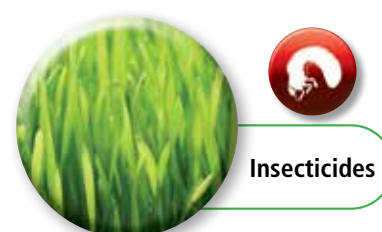
Control Insects and Pests