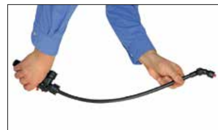
Practically unbreakable, 20" plastic spray wand