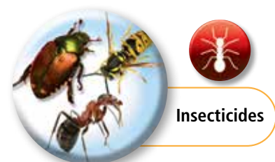
Kill Flying and Crawling Bugs