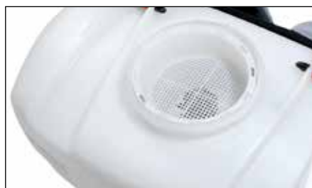
Large opening to facilitate filling, draining and cleaning. Filling strainer with large filter surface area.