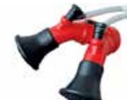
Twin nozzle Part # 49 00 137