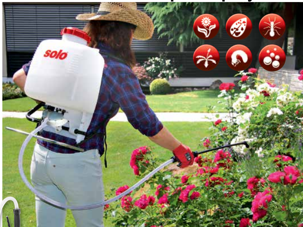
473-P (Piston) 473-D (Diaphragm)