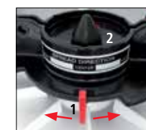
Adjustable distribution direction (1), agitator (2)