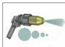
Brass adjustable nozzle