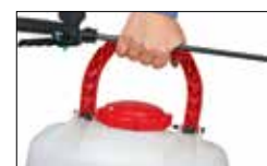
Extra large carrying handle