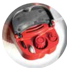
Unique storage compartment