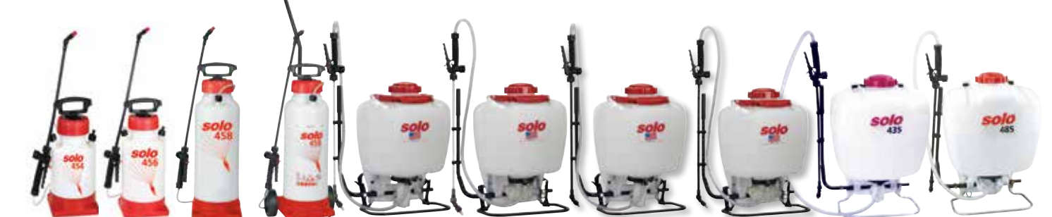
One-Hand Sprayers 418/418-2L/419/420/201C/202C/202CL Handheld Sprayers 430-1G/430-2G/430-3G Backpack Sprayers 473-P/473-D/425/475-B