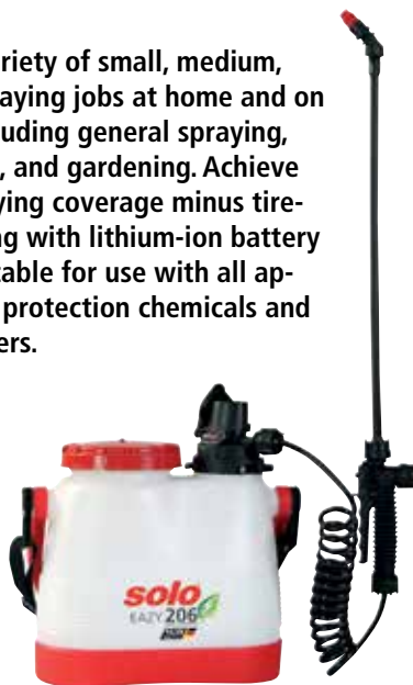
EAZY 206 Battery-Powered Handheld Sprayer