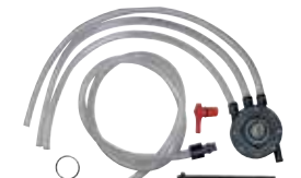
Liquid booster pump Part # 44 00 117