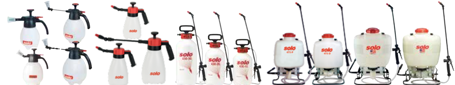
One-Hand Sprayers 415/201/202 Hose-end Sprayer 405-HE Handheld Sprayers 211/212 Backpack Sprayer 410/NOVA 424 Battery-powered Sprayers 260/EAZY 206/411/441