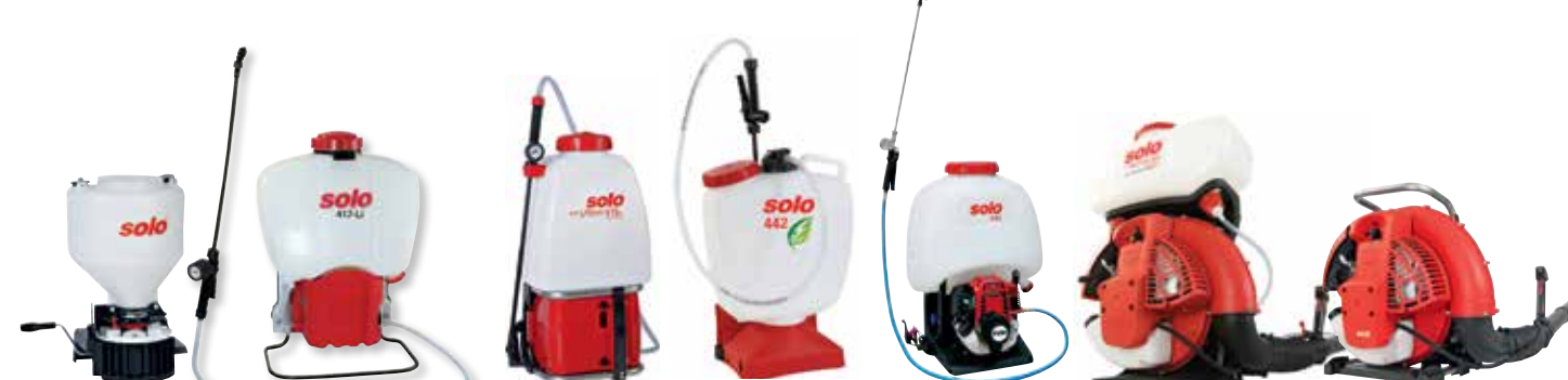
Handheld Sprayers 454/456/458/458-Rollabout Backpack Sprayers 425-PROF/425-101/475-PROF/475-101/435/485