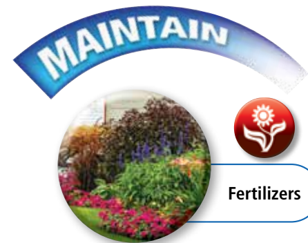
Maintain a Beautiful Yard