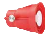
ULV nozzle with metering device Part # 49 480