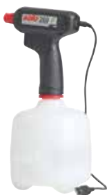
260 Battery-Powered One-Hand Sprayer