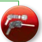
Jet Stream Nozzle

Includes 4 Nozzles to Meet Virtually Every Spraying Need Accepts TeeJet® nozzle tips