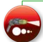
Brass Adjustable Nozzle

Commercial quality interchangeable nozzle system