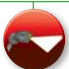
Brass Fan Spray Nozzle