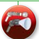
Hollow Cone Nozzle