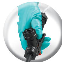
Easy grip shut-off valve reduces hand fatigue