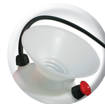
Built-in funnel top for easy fill-up